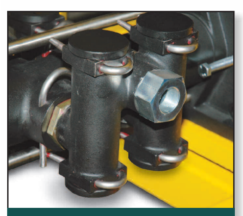
Patented U-clip design dramatically reduces disassembly time for cleaning and maintenance.

The field proven ChemGrout High-Pressure Series offers maximum performance and versatility for the grouting of mines, dams, tiebacks, foundations, soil & rock anchors.