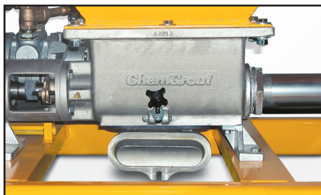
Easy access clean-out port.

This simple, easy to use system is complete and ready for jobsite operation. The mix tank is equipped with bag breaker, baffles and a variable speed high-efficiency paddle that provides high shearing action for thorough and complete particle wetting. The tank outlet valve is a large slide gate that allows the thickest materials to fall easily into the pump