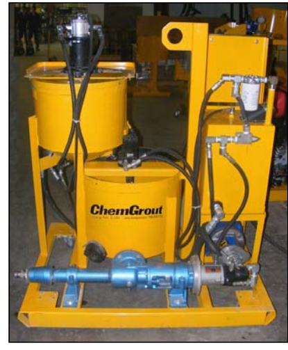
2L4 Progressive Cavity Pump

the repair of small voids. Materials include Sika 300 PT, MBT 1205 and a wide variety of other PT grouts. This unit features a 20-gallon (76 liters) high shear mixing tank, a 2L4 progressing cavity pump, and a 34 gal (128 liter) agitator tank, all powered by a 230/460V, three phase electric motor. The mixing tank is equipped with a baffle and a variable speed high-shear propeller, rotating at speeds up to 3000 rpm, providing rapid mixing action. From the mix tank, material flows through a large 4" slide valve, onto a fine mesh screen, and into the agitator tank. The injection pump is a variable speed, positive displacement, progressing cavity pump that delivers up to 6 gpm, 174 psi (22 lpm, 12 bar). This unit is powered by a 7.5 HP heavy duty, high efficiency electric motor that drives the hydraulic motors for the mixer, agitator and pump. The rugged steel frame, complete with caster type wheel stands up to the toughest conditions on the job site. All moving parts are covered for safety. Operator controls are centrally located for efficient production.