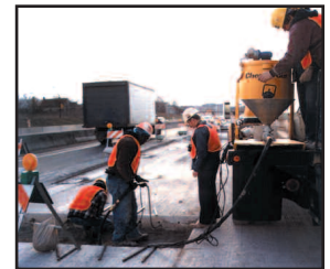
Highway Dowel Rods