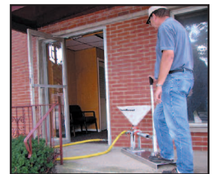
Filling Door Frame