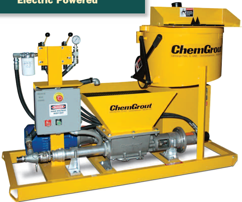
CG-550/2C4/EH Electric Powered