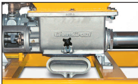
Easy access clean-out port.

This simple, easy to use system is complete and ready for jobsite operation. The mix tank is equipped with bag breaker, baffles and a variable speed high-efficiency paddle that provides high shearing action for thorough and complete particle wetting. The tank outlet valve is a large slide gate that allows the thickest materials to fall easily into the pump