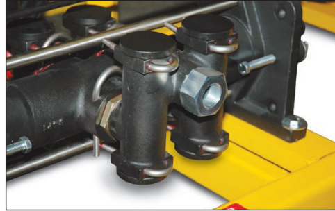
2X8DBL Plunger Pump

The CG460 Series is available in a variety of power options models include air, hydraulic, electric/hydraulic (25 HP electric motor), and diesel/hydraulic (33 HP Kubota Engine). Both electric and diesel model require a separate skid mounted power pack. The rugged steel frame stands up to the toughest conditions on the job site. Operator controls are centrally located for efficient production. All components are easily accessible for operating, cleaning and maintenance.