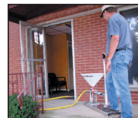
Filling Door Frame