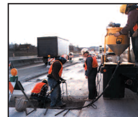
Highway Dowel Rods