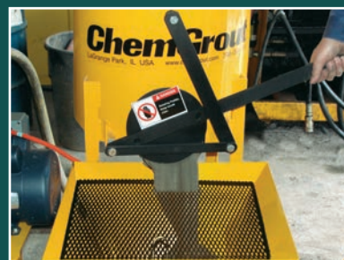
Mix tank's large slide gate allows for an easy transfer of material.