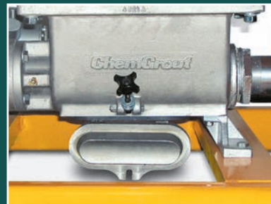
Hinged cleanout port on suction housing offers quick access and easy clean-up.