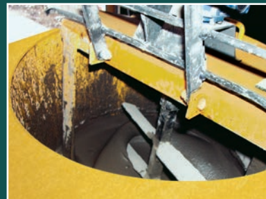
Three tough steel mixing blades thoroughly blend material providing a uniform mix.