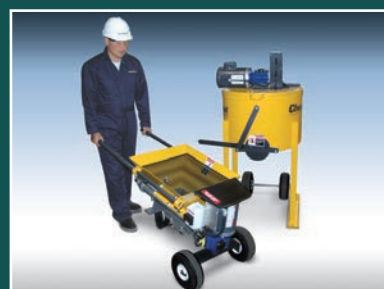
Two-piece construction makes for easy mobility through standard size doorways.