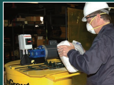
Twenty-two gallon mix tank allows for a batch size of up to 3-50 lb. bags.

Visit our web site: www.chemgrout.com • E-mail: info@chemgrout.com